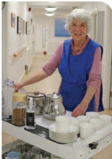
spring / summer 2022 • HOSPICE MATTERS

"I still really enjoy the volunteering here, as I did when I started years ago, and I've made so many fantastic friends along the way."