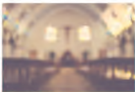
Burial, Crematorium and Church Funerals