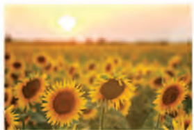
Non - Religious Celebrations of Life