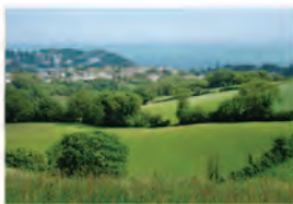
Green Burials at Sharpham & Cockington