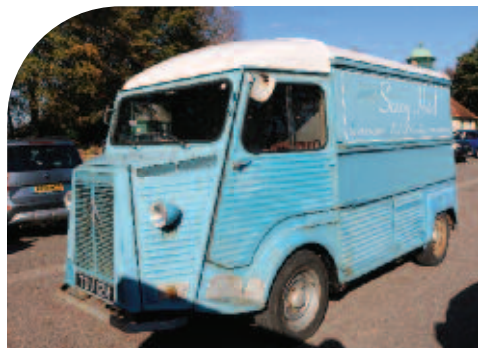
H Van prior to transformation