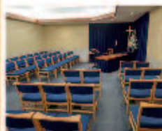
Private Service Chapels More personal and less expensive than a service at Torquay Crematorium