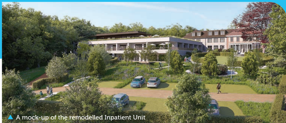
▲ A mock-up of the remodelled Inpatient Unit