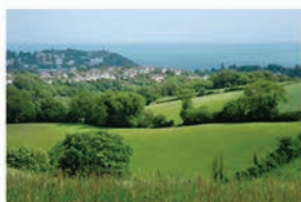
Green Burials at Sharpham & Cockington