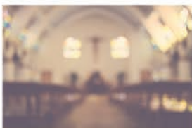
Burial, Crematorium and Church Funerals