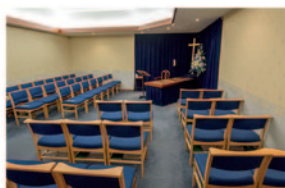
Private Service Chapels