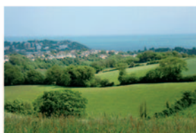
Green Burials at Torquay & Sharpham