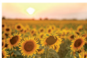
Non-Religious Celebrations of Life