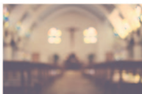
Burial, Crematorium and Church Funerals