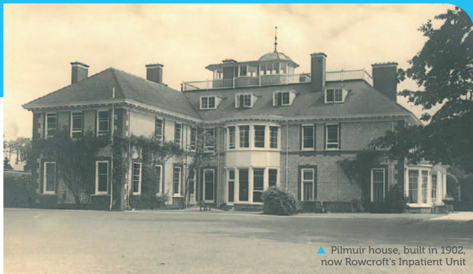
▲ Pilmuir house, built in 1902, now Rowcroft's Inpatient Unit