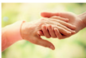
Pre Paid Funeral Plans